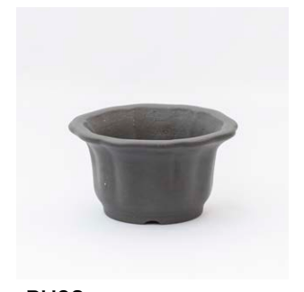
RH02 Flower shaped very deep pots

Clay Type: Black Clay Glaze Type: Unglazed Retail Price: JPY13,650 Size: W160·D160·H80mm