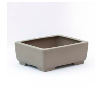
RH04 Rectangle no edge pots

Clay: Black Clay Glaze Type: Unglazed Retail Price: JPY21,700 Size: W190 · D190 · H100mm