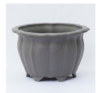
RH06 Kokyo very deep pots

Clay: Showa Clay Glaze Type: Unglazed Retail Price: JPY27,300 Size: W230 · D230 · H150mm