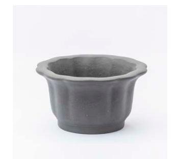
RH03 Flower shaped very deep pots

Clay: Black Clay Glaze Type: Unglazed Retail Price: JPY20,300 Size: W160 · D160 · H85mm