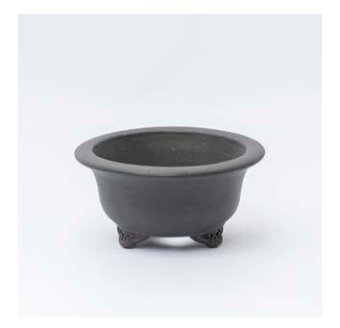
RH01 Round pots with cloud feet

Clay Type: Black Clay Glaze Type: Unglazed Retail Price: JPY13,650 Size: W160·D160·H80mm