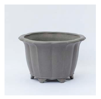
RH05 Kokyo very deep pots

Clay: Showa Clay Glaze Type: Unglazed Retail Price: JPY17,500 Size: W260 · D210 · H100mm