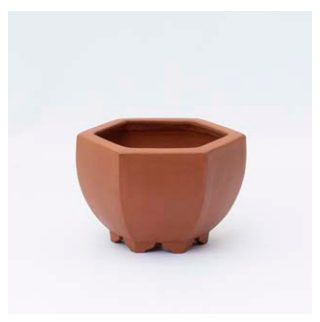
RH09 Hexagon Shamido pots

Clay: Vermilion clay Glaze Type: Unglazed Retail Price: JPY13,650 Size: W220 · D220 · H80mm