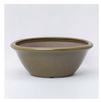
RH10 Round pots circle edge with hill

Clay: Vermilion clay Glaze Type: Unglazed Retail Price: JPY18,200 Size: W150 · D150 · H100mm