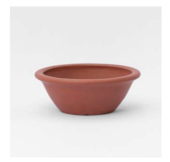
RH08 Round pots circle edge

Clay: Vermilion clay Glaze Type: Unglazed Retail Price: JPY11,900 Size: W100 · D100 · H65mm