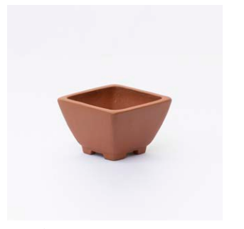
RH07 Square curve shaped pots

Clay: Showa Clay Glaze Type: Unglazed Retail Price: JPY 52,500 Size: W310 · D310 · H205mm